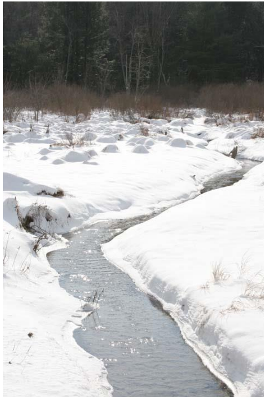
Frozen wetland in Hartland, Fred Jones