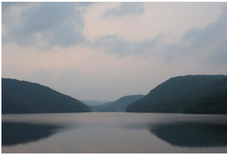
Northern view from Hogback/Goodwin Dam, Fred Jones

The GIS data used in this report comes from many different sources (notably the CT DEP, FRWA, the Town of Hartland, the MDC, and Planimetrics) and therefore has different levels of accuracy. It should be considered appropriate for town level planning exercises, but may not be adequate for parcel level analysis. Some of the data is general in nature, and some provides significant detail. It will be important to field verify any information used in an actual decision making process. As the availability of GIS data grows and improves it will be a relatively simple process to update and improve this document.